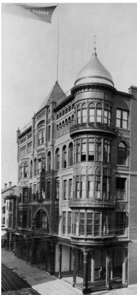
Photo of Conrad Building c. 1890